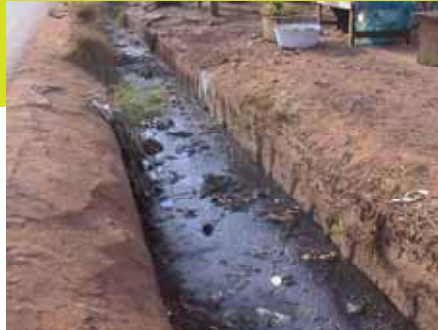
Open drainage as a consequence of missing connection to the central sewer system

As a result, neither the general nor the specific requirements on wastewater treatment are complied.